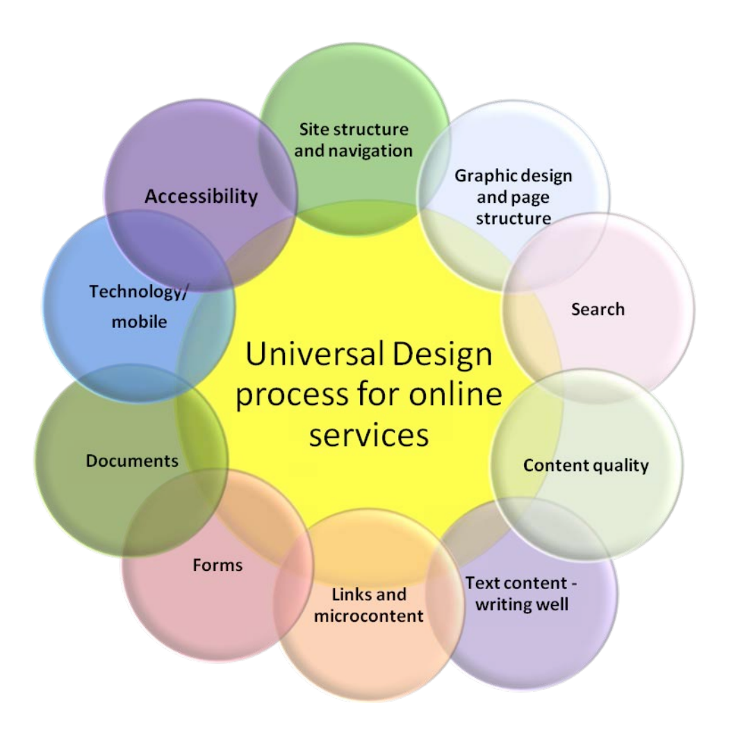
Figure 1 Key areas of Universal Design guidance for online public services